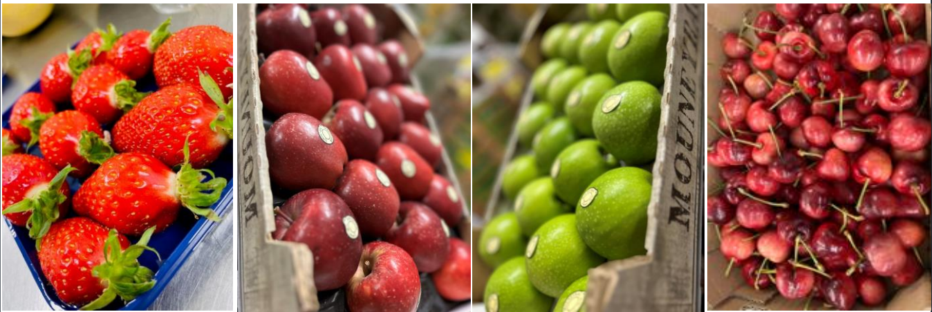
Garigette Strawberry, Red Delicious & Granny Smith Mouneyrac Apple and Spanish Organic Cherry.