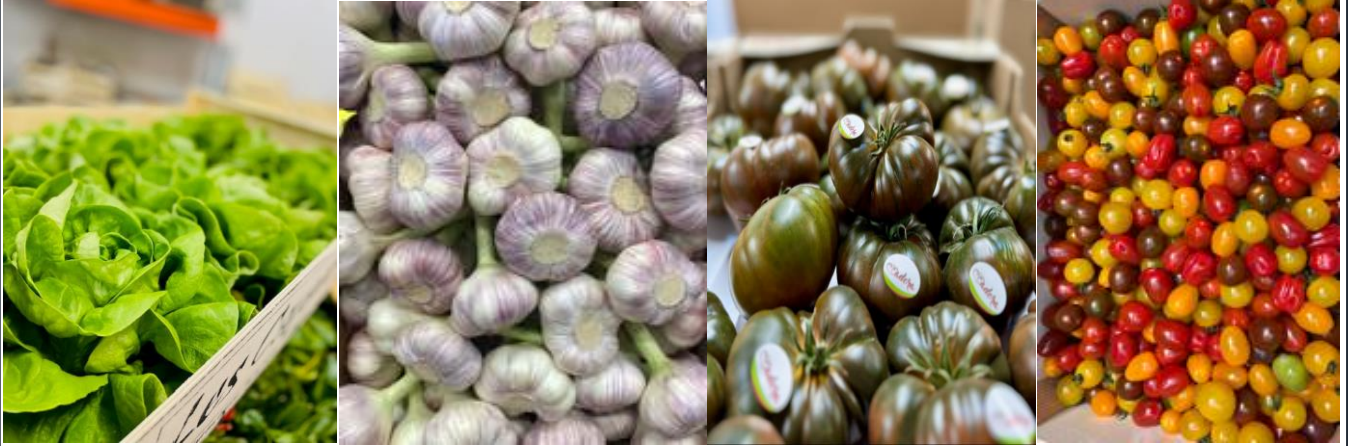
Butterhead Lettuce, Wet Garlic, Ribbed brown Adora Tomato and mixed colour Cherry Tomato.