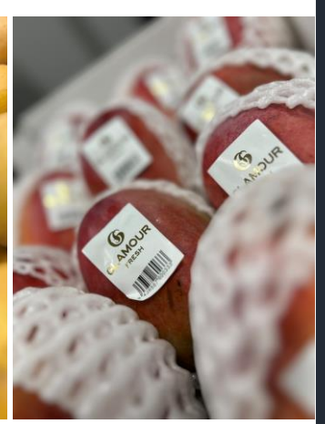
Mixed UK organic squash, UK Cox apple, Russet apple and Premium air freight mango.