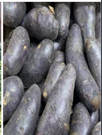
Super sweet Mandarin, UK mashed potato Squash, New season UK Savoy cabbage and Vitelotte purple potato. Keep an eye out on our Instagram page for daily updates on fresh-in produce and new ingredients @valimexItd