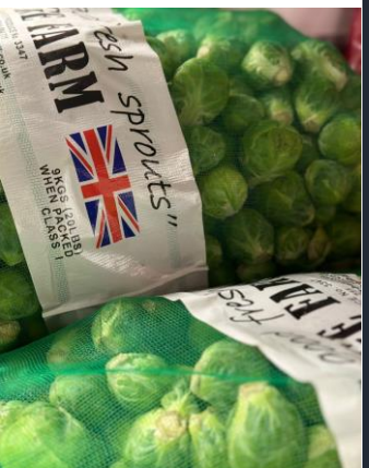
New season UK Parsnip, Lancashire Purple and white variegated kale and UK Brussel sprout.