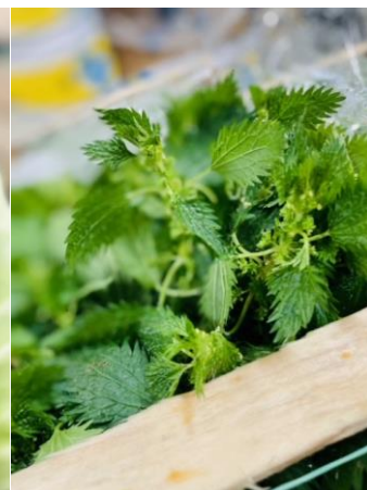
Chilean Cherry, Italian Red Pepper, Hispi Cabbage and Italian Nettle.