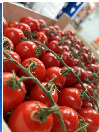
Jersey Royal Potato, Italian Broad Bean, UK New Forrest Asparagus and Italian Vine Cherry Tomato .